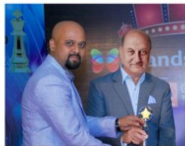
Receiving Award for Best Hotel Management College in Eastern India from Anupam Kher