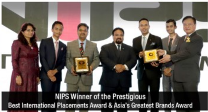
NIPS Winner of the Prestigious Best International Placements Award & Asia's Greatest Brands Award